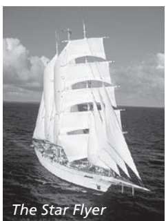
The Star Flyer

Trip Information Meeting Thursday, June 7 | 6:30 PM, Banquet Room